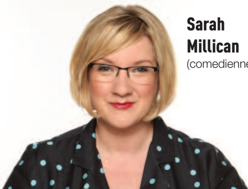
Sarah Millican (comedienne)

If the theatre is not for you, there are plenty of other venues that offer a cultural experience or live music and entertainment. You'll find a variety of art galleries dotted across the city, as well as some great places to catch a gig, such as the Monkey Café & Bar (Castle Street), the Vault (Salubrious Place), and Sin City (Dillwyn St), amongst others.